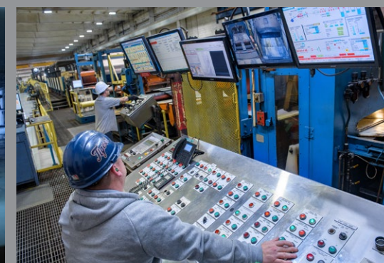
Pickler Exit Operator Station