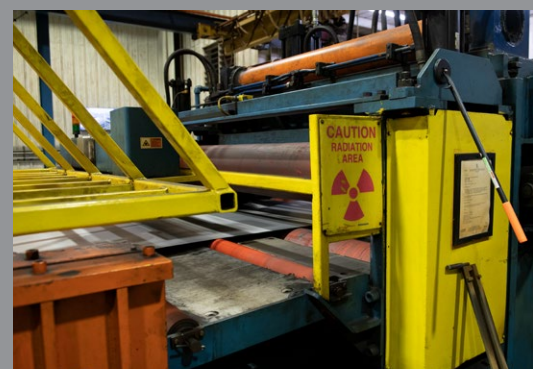
Gamma Gauge Control