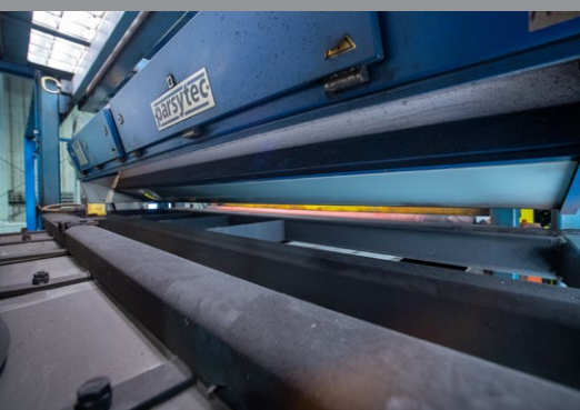
Parsytec Top and Bottom Surface Inspection