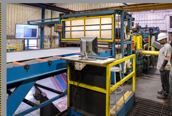
Quality Inspection Table