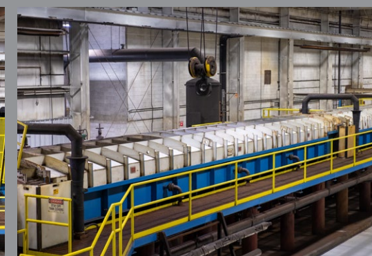
HCl Acid Bath