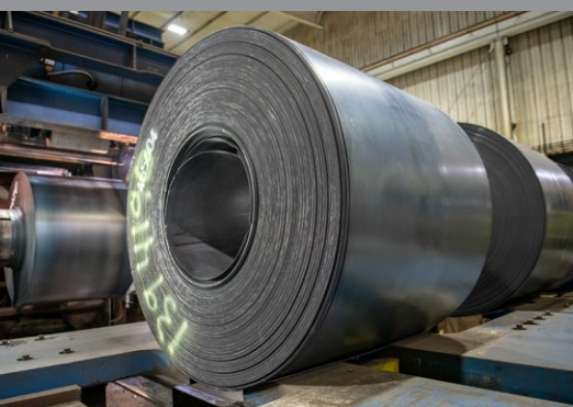
Pickler Entry Staging and Uncoiler