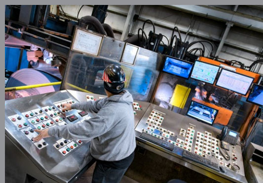
Pickler Entry Operator Station