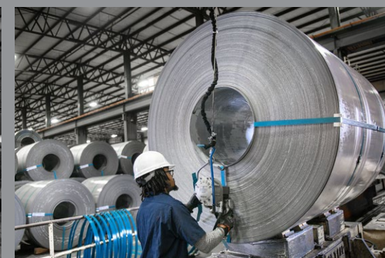
Offline Coil Banding Station